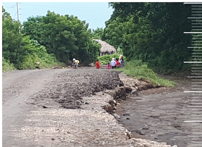
Runoff water affects the main access to the communities Mechapa and Paniquines