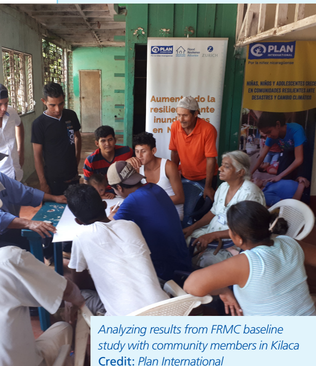
Analyzing results from FRMC baseline study with community members in Kilca

The Flood Resilience Measurement for Communities (FRMC) framework comprises two parts: The Alliance's framework for measuring community flood resilience and an associated tool for implementing the framework in practice.