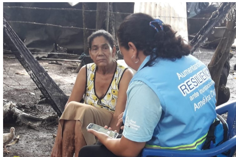
Interview during FRMC baseline survey in Mechapa

Plan is a children’s rights organization with key expertise in gender equality. Community development projects with children and adolescents are at the heart of its work. Plan supports the rights of boys and girls from birth until adulthood. Plan supports community members, including women and children, in disaster risk management to prepare them in the event of a flood. Together with local partner organizations, Plan implements several different activities in its intervention communities. These include founding community response committees and training them in first aid and