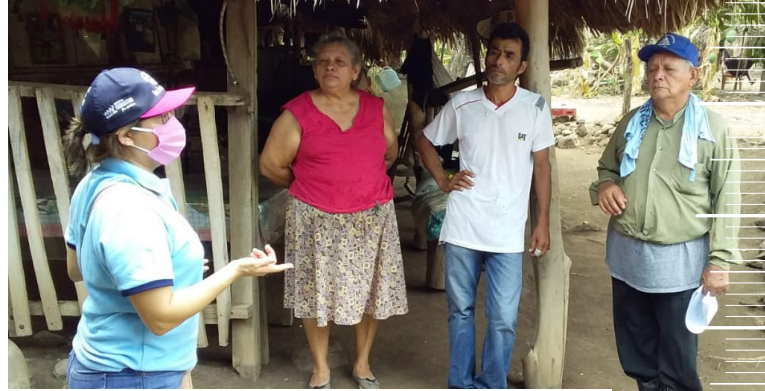
Members of INETER and Plan International Nicaragua visit a family in Kilaca to ask them about the impact of flooding on water and sanitation in the community

Plan works with approximately 1,500 direct and 2,750 indirect beneficiaries in four communities in the municipality of El Viejo, department of Chinandega. Based on information from the Disaster Risk Management unit in the municipality, we have identified that these four communities are located in an area that floods on an annual basis and have been seriously affected by these floods over the past ten years. As a result of climate variability rainfall is increasing. According to the Nicaraguan Institute of Territorial Studies (INETER) these communities are located between 0 to 35 metres above sea level. Their proximity to sea level whilst being surrounded by mountainous areas of much higher altitude creates vulnerability as flood waters flow down from the mountainous areas to the low-lying populated areas, causing destruction. The intervention communities are also vulnerable because of factors including high levels of poverty and lack of consciousness about flood resilience.