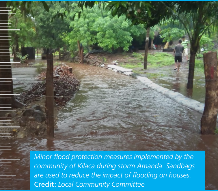
Minor flood protection measures implemented by the community of Kilaca during storm Amanda. Sandbags are used to reduce the impact of flooding on houses.