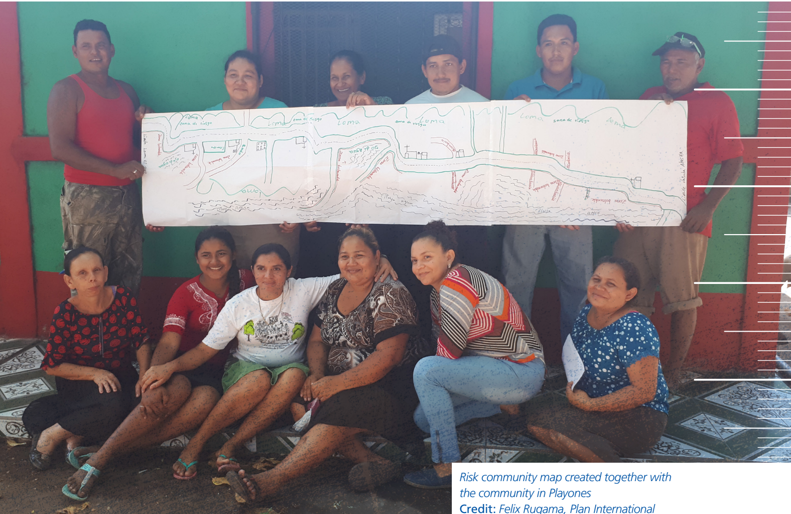
Risk community map created together with the community in Playones